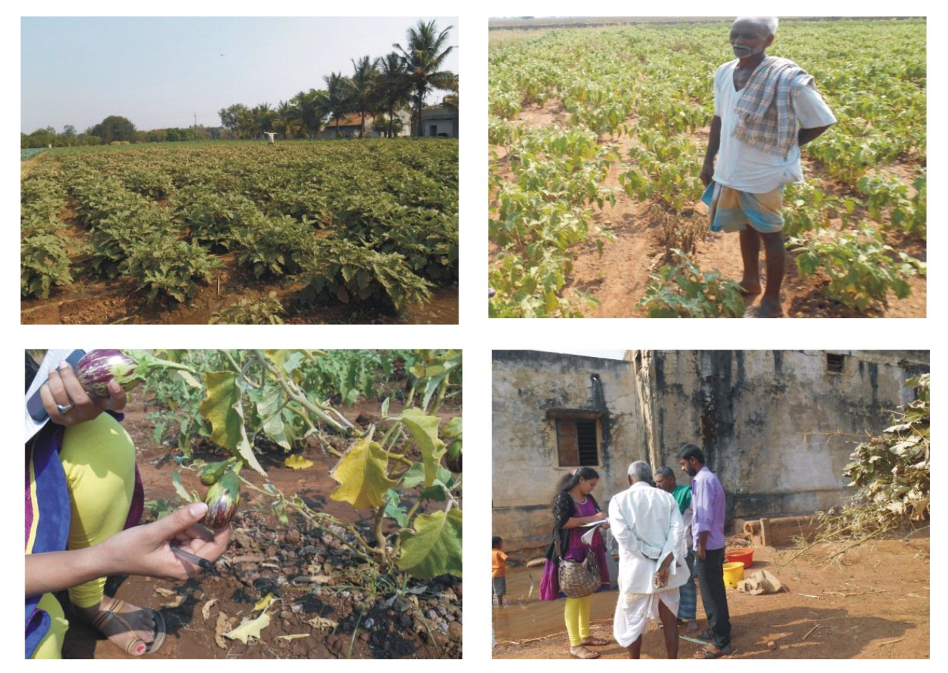
Plate 1: Farmer's field survey.